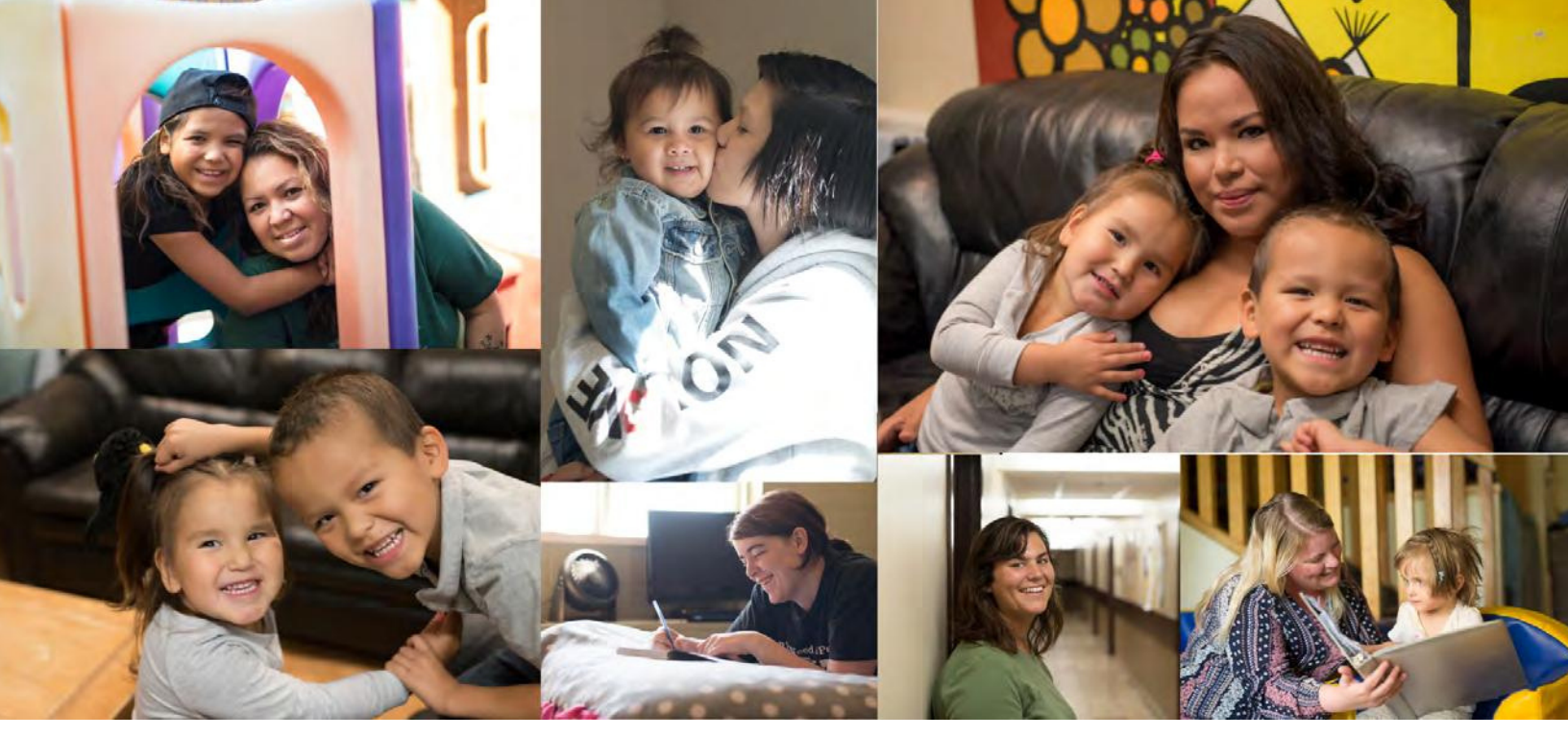
Your gift will ensure more women, girls and their families are empowered in an equitable community.